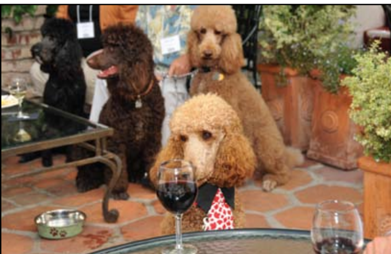
Below: On the patio and in the lounge of the Cypress Inn

The other interesting thing to me was the number of apricots, reds and browns... a far